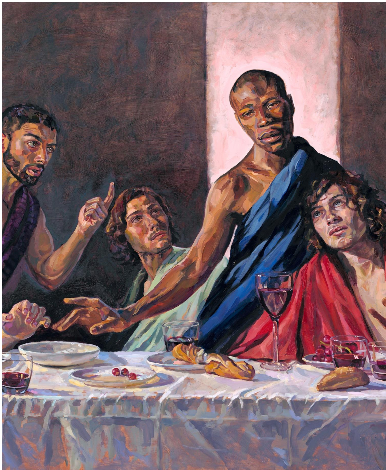
A Last Supper (detail, 2009)