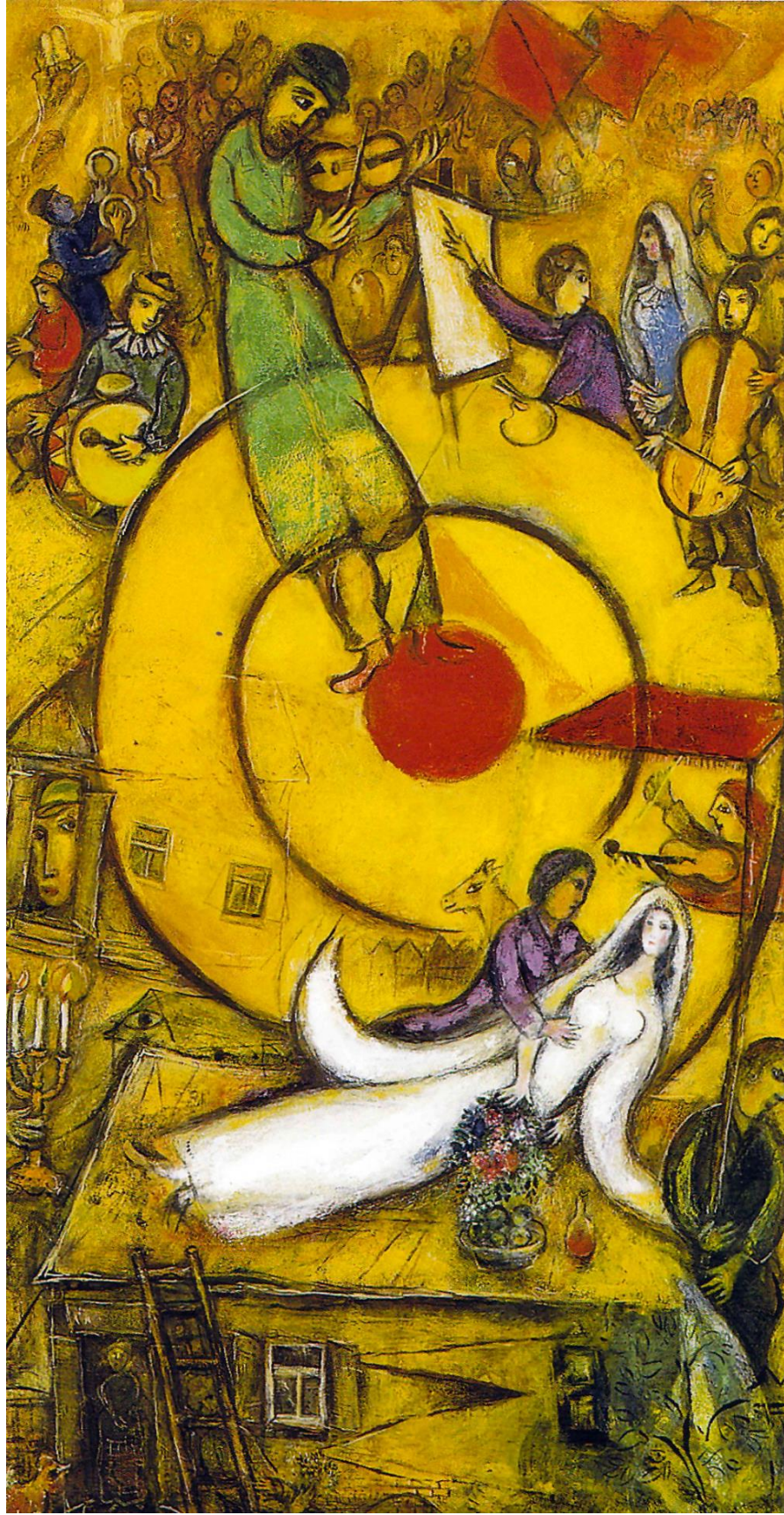
Libération Marc Chagall (1887–1985)